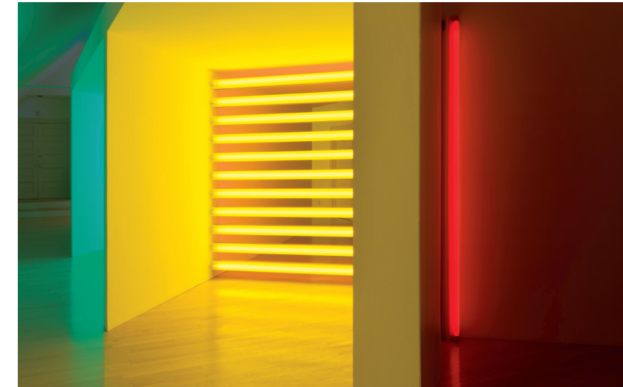
Dan Flavin nine sculptures in fluorescent light, 1963–81